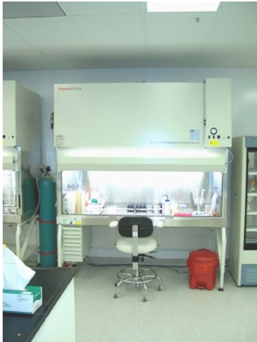
Figure 1: Biological Safety Cabinet for Gel Processing.

For all intent and purpose, we define keratin-free to represent a state in which contamination by environmental keratins is minimized to a point below that of the low abundance proteins typically found in your biological samples. Removing keratin contamination in the BSC that is dedicated to the gel work should be the first step in the process. In addition to the decontamination of the BSC, there are additional steps that you should take to reduce the problem of keratin contamination.