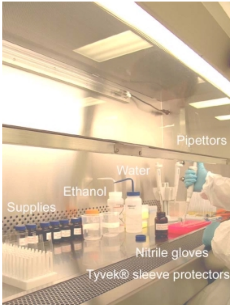
Figure 2: Clothing and Equipment used to establish and maintain a Keratin free environment.

Clearly, not all equipment and materials can be located within the BSC at all times. If items are to be shuttled in and out of the BSC, it is good practice to locate them on a biohazard mat or clean room wipe when working with them outside and on another while inside the BSC. At the end of the day or experiment the mats and wipes can be discarded, reducing the possibility that keratins are transferred to the floor of the BSC. Lastly, keep the front shield of the BSC closed whenever not in use.